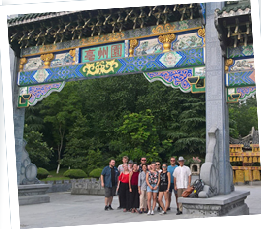
HdWM students on an excursion to China