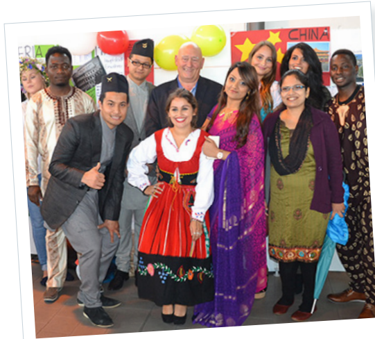
Festival of Cultures