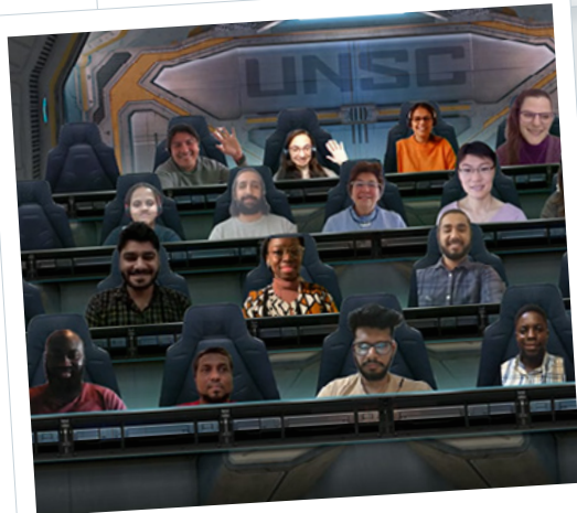
Welcome Week Online