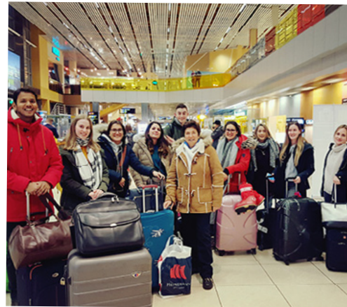
HdWM students all packed for their excursion to Russia