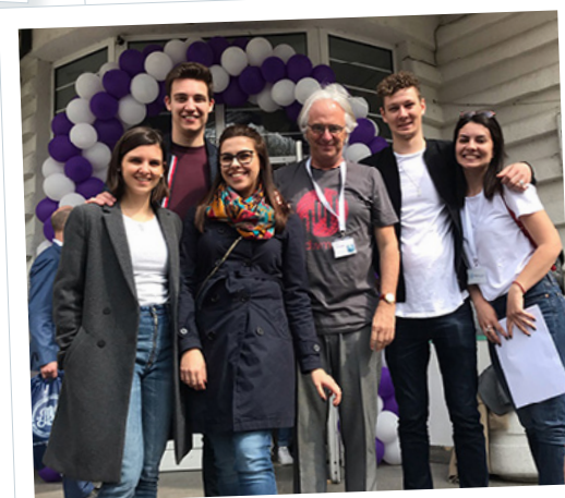
Case Study Competition Belgrad, Serbia