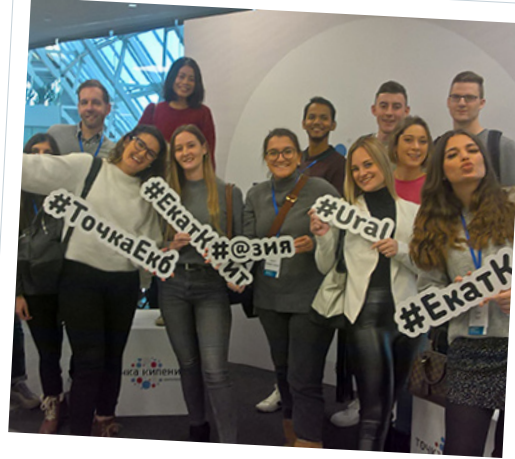
International Student Workshop Yekaterinburg, Russia